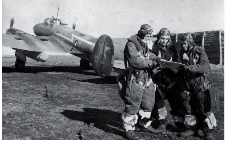
Pe-2 crew from the 34th gv.bap TAF (Pacific Fleet), August, 1945.

The centre for archives of the Soviet Ministry of Defence joined the discussion. They published the official account from the Army's Summary of Events from February 11, 1945, in which there was detailed information on