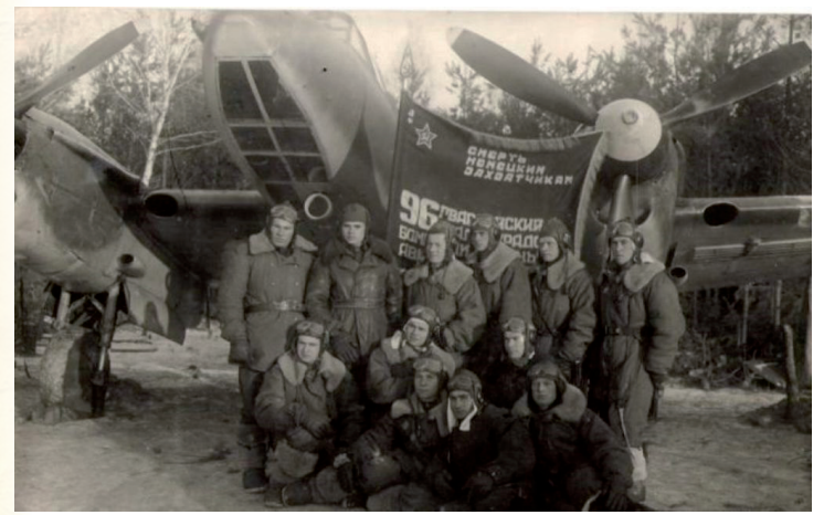
The crews of one of the Pe-2 groups photographed with the 96th gv.bap combat pennant. The 96th was equipped with the Pe-2 from June 17, 1943 til the end of the war.

Back at the airfield, there was an increasingly impatient anticipation of the return of the bombers. The expect flightime of the nine crews was quickly coming to an end. Finally, the first of the Pe-2s began to appear on the horizon as they laid in their final approach course. However, the General's aircraft, clearly marked with a white lightning bolt down the length of the fuselage and a rendering of a lion on the sides of the fuselage below the cockpit was not among them. In the final hectic battles of the war there was little time to ponder such details