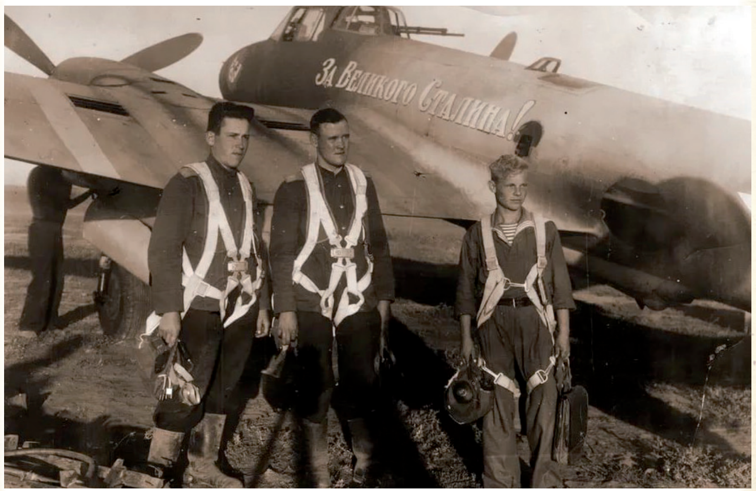
Three member Pe-2 crew from the 12th gv.bap, BMF (Baltic Fleet). A Guards badge appears below the cockpit and a large red-outlined white inscription in Cyrilic on the fuselage. End of October, 1944.