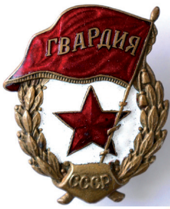
Guards emblem in a Second World War incarnation.