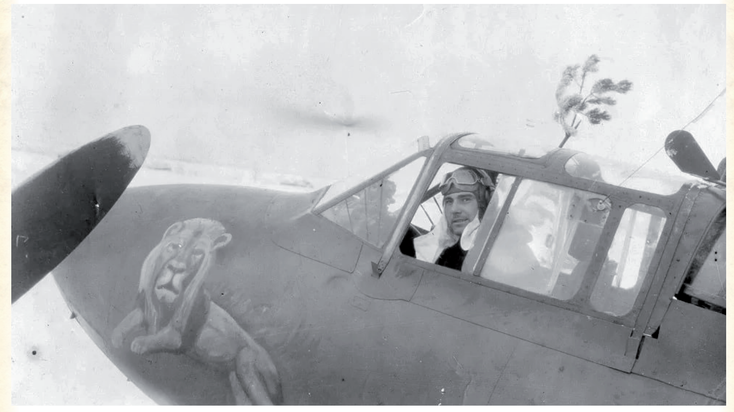
The rather vicious lion artwork was a favorite among the pilots of these aircraft.

Back at the airfield, there was an increasingly impatient anticipation of the return of the bombers. The expect flightime of the nine crews was quickly coming to an end. Finally, the first of the Pe-2s began to appear on the horizon as they laid in their final approach course. However, the General's aircraft, clearly marked with a white lightning bolt down the length of the fuselage and a rendering of a lion on the sides of the fuselage below the cockpit was not among them. In the final hectic battles of the war there was little time to ponder such details